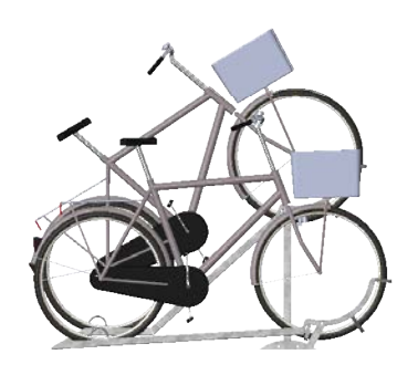
(Measurements in mm)